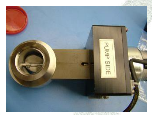
Aldon Proprietary Information