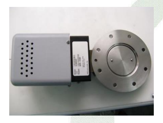
Aldon Proprietary Information